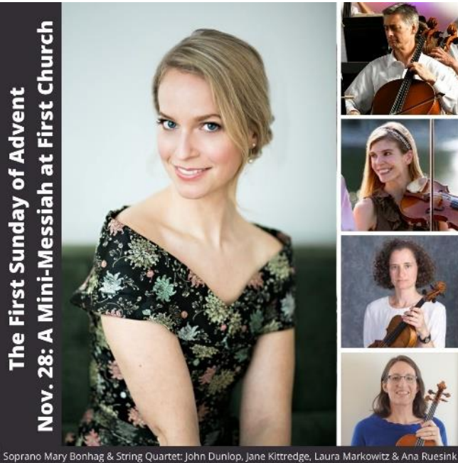
The First Sunday of Advent Nov. 28: A Mini-Messiah at First Church