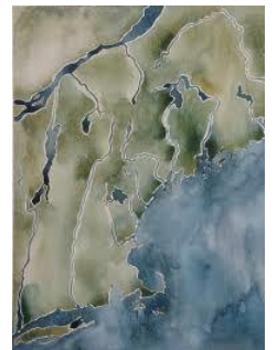
Aerial View of N'dakinna

The Vermont Indigenous Heritage Center and Alnôbaiwi: Focusing on indigenous culture and heritage - inter-tribal indigenous citizens, friends, and allies are coming together to participate in living history, culture, fellowship, and ceremony. Both organizations are in partnership with Ethan Allen Homestead and Winooski Valley Park District. http://alnobaiwi.org/