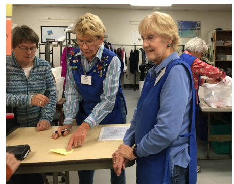
Possibility Shop Volunteers.

For the past many decades, one of the largest works of First Church has been our support of the Ronald McDonald House, by renting the parsonage for $1/year. Now that the sale has been completed, we have the exciting opportunity to think about new ways to engage our faith through works here at the church. What ministry is God calling us to together?