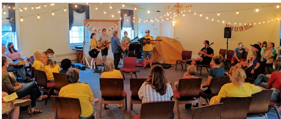
Peace Camp Band, July 2022