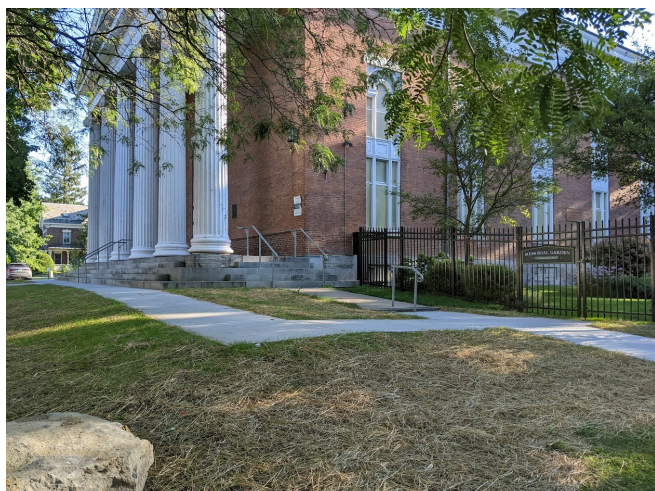
Memorial Garden Walkway Construction—Finished.