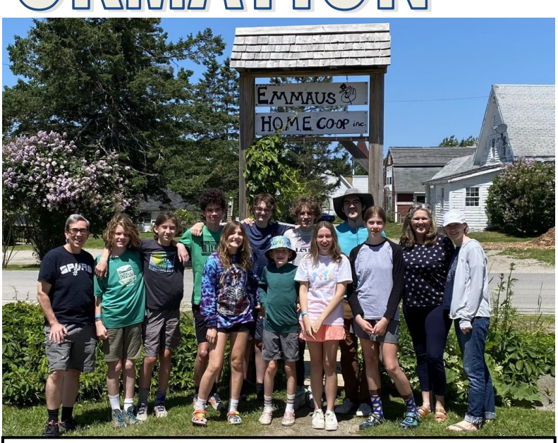
June 2023—Middle and High School Youth Trip to Maine to serve with HOME, Inc.