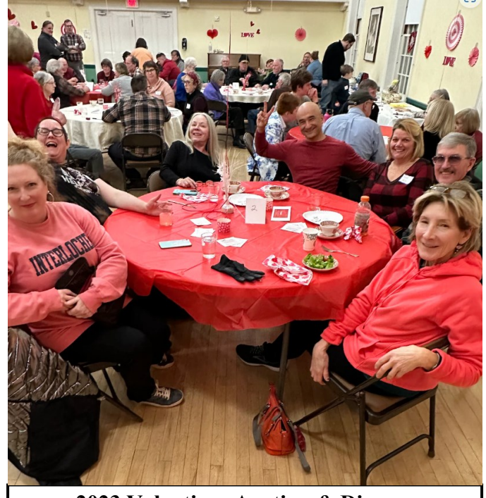
2023 Valentines Auction & Dinner.