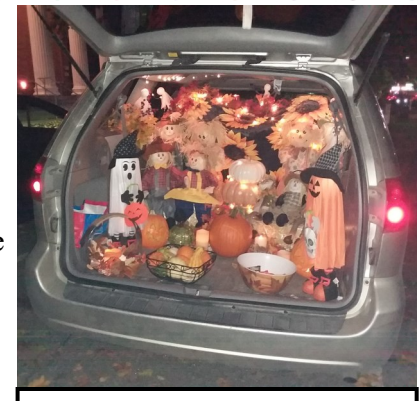
2023 Trunk or Treat.

We have a small but mighty team which is very busy behind the scenes so that, together, we will continue to grow the church. We developed a new visitor process providing Radical Hospitality to our new visitors through a warm and friendly