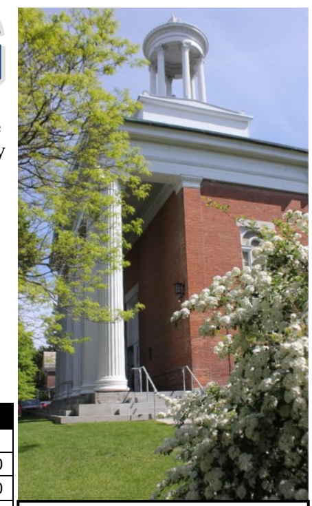
Spring 2023—FCC Building, Front Portico.