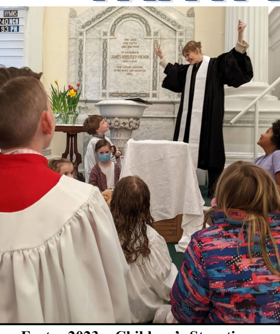
Easter 2023—Children's Storytime.