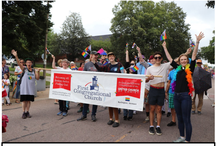
FCC at the 2023 Burlington Pride Parade.

We seek to connect visitors, congregants, and the greater Burlington community with the people and work of First Church. But how do we put this mission into practice?